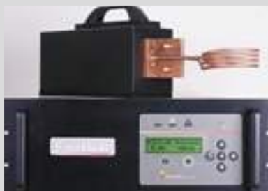
Magnetic Nanoparticle Hyperthermia

Our Goal is to cultivate Leadership and Entrepreneurship Quality.