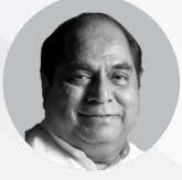
पद्मश्री डॉ. डी. वाय. पाटील साहेब (माननीय राज्यपाल, त्रिपुरा, बिहार व पश्चिम बंगाल)