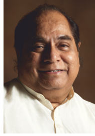
Hon'ble Dr. D. Y. Patil