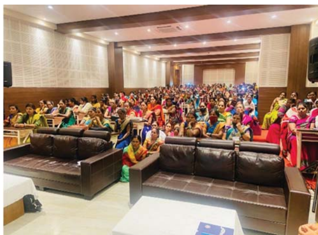
COLS Training Gargoti