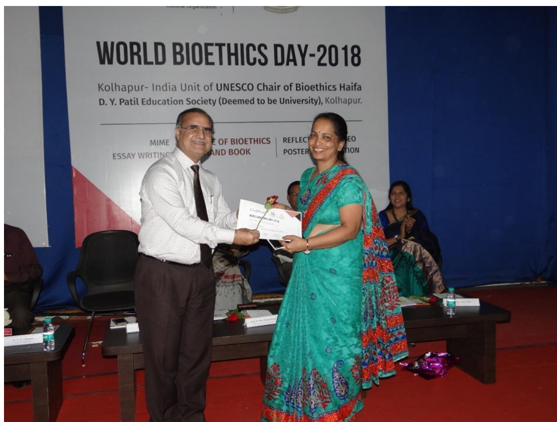
FELICITATION OF JUDGE