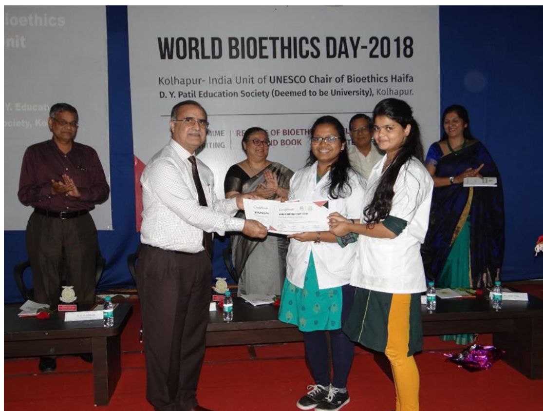
Poster Presentation – PRIZE DISTRIBUTION