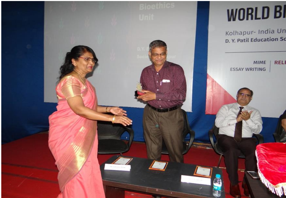
Felicitation of Dignitaries