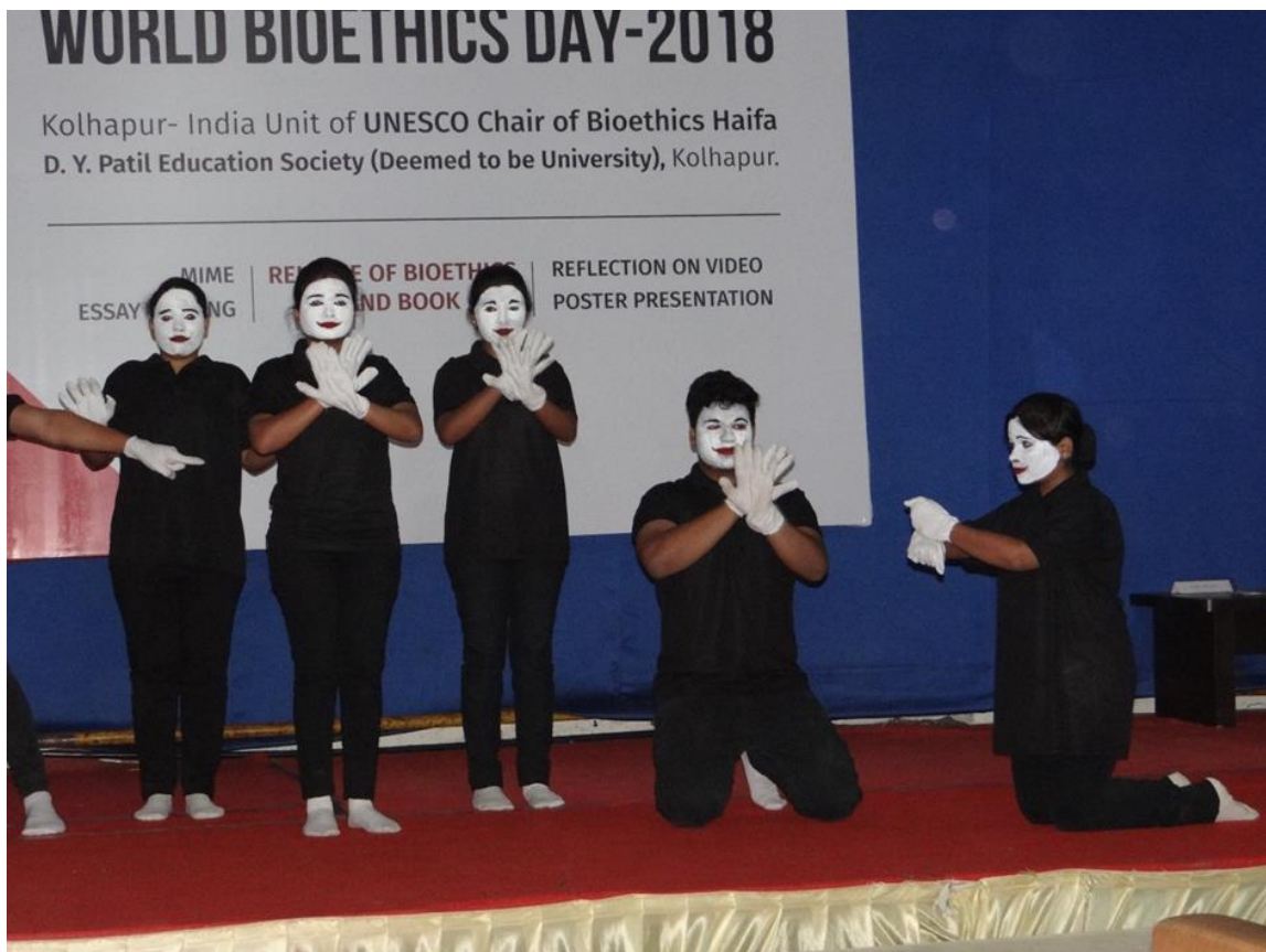
Mime by Nursing Students