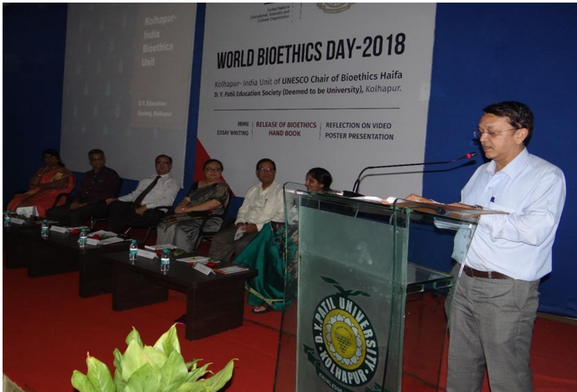
Announcement of: Poster Presentation 1st Prize and 2nd Prize