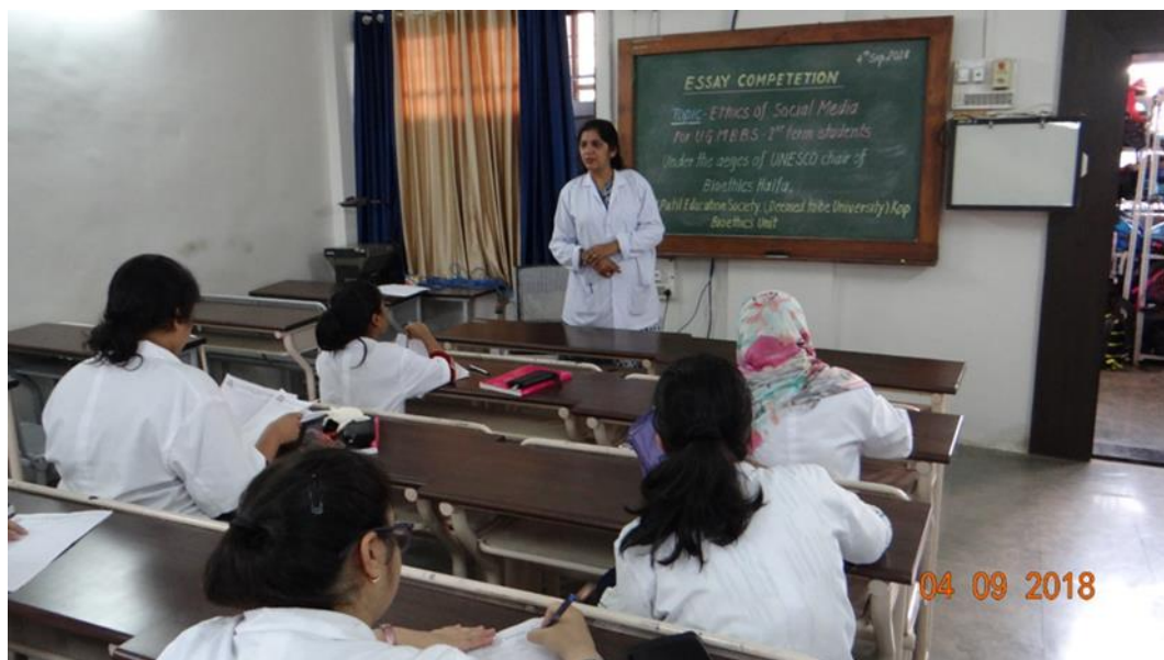
Essay writing competition on topic: Ethics of Social media