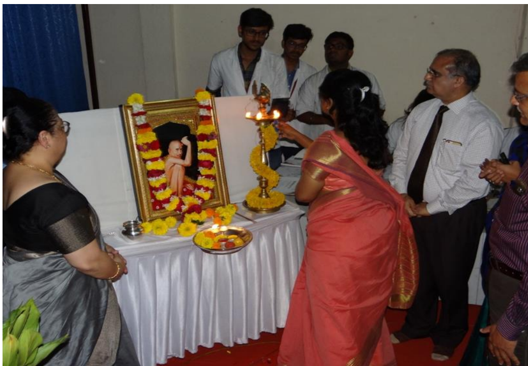
Lamp lighting ceremony and watering the plant