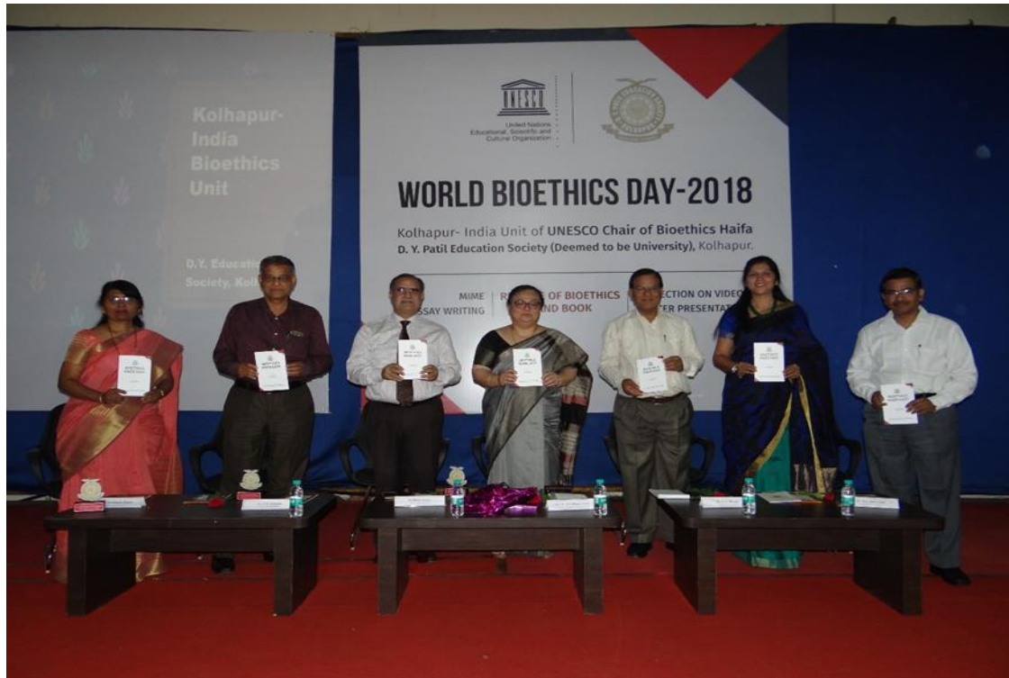
Information regarding booklet and Release of Booklet