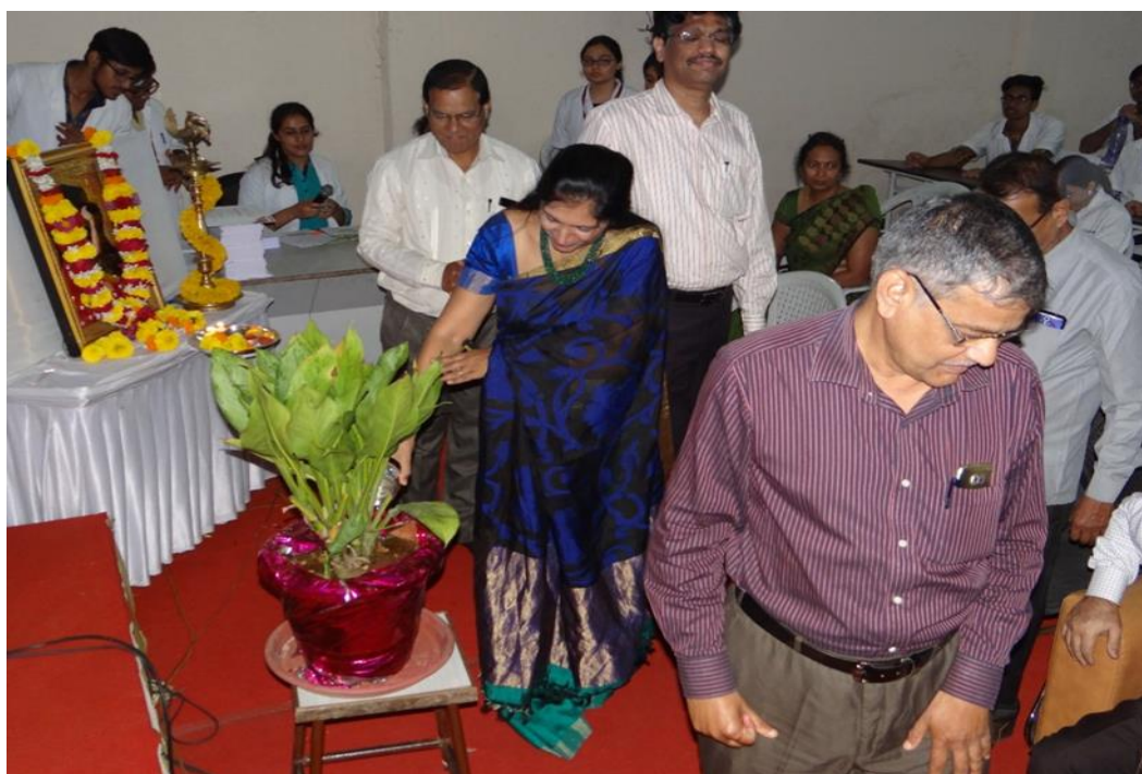
Lamp lighting ceremony and watering the plant