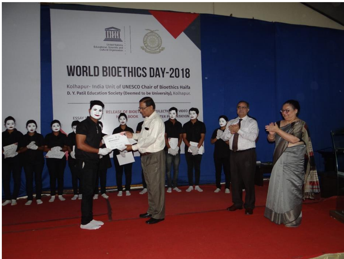
MIME – CERTIFICATE DISTRIBUTION