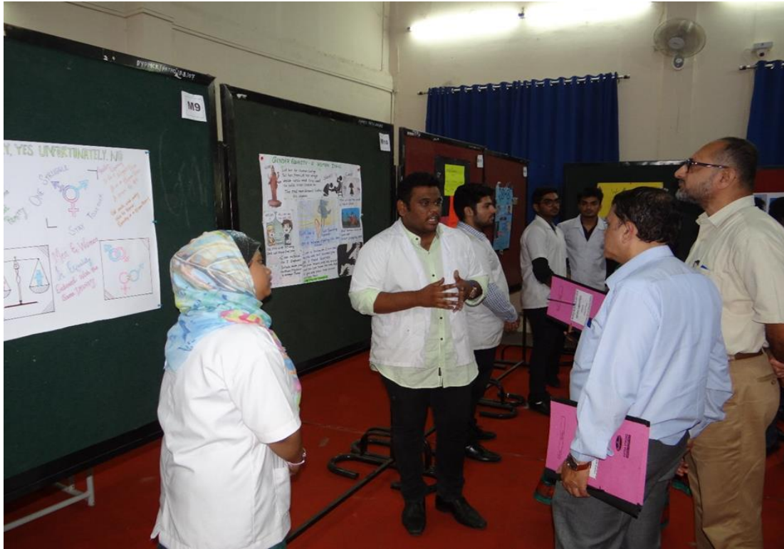
Poster Presentation- Bioethics or Gender Equality