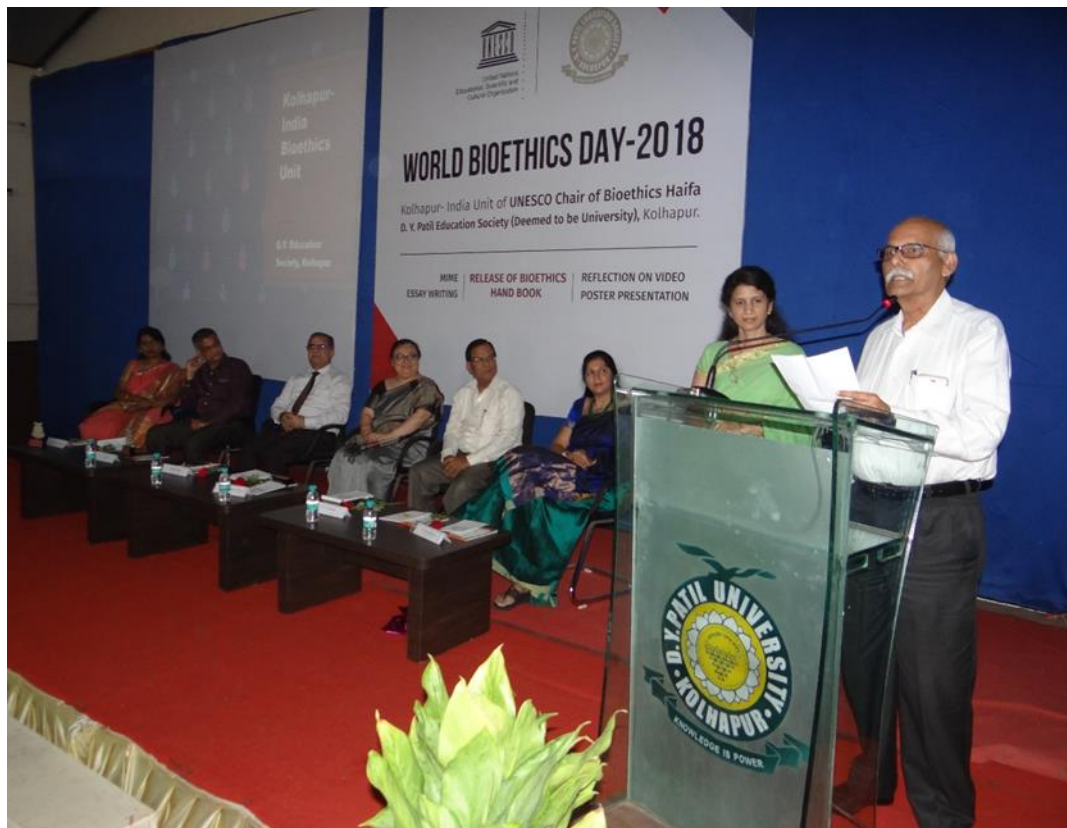
Announcement of: Essay writing 1st Prize and 2nd Prize