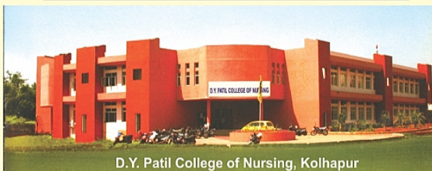
D.Y. Patil College of Nursing, Kolhapur

For further details visit : Web site: www.dypatilunikop.org