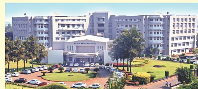
Dr. D.Y. Patil Medical College Hospital and Research Institute, Kolhapur